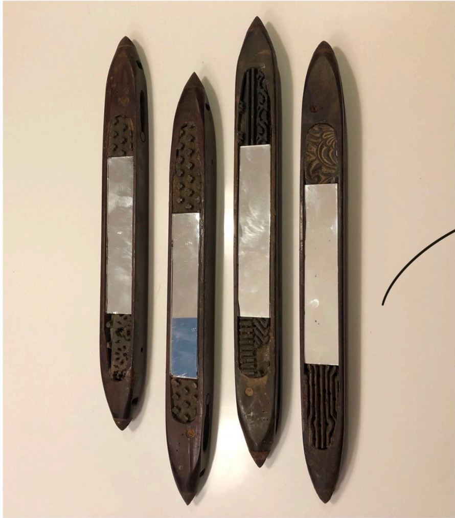
12.5 x 40.4 ft 150 shuttles (18-24 Inch) to be mounted on the wall