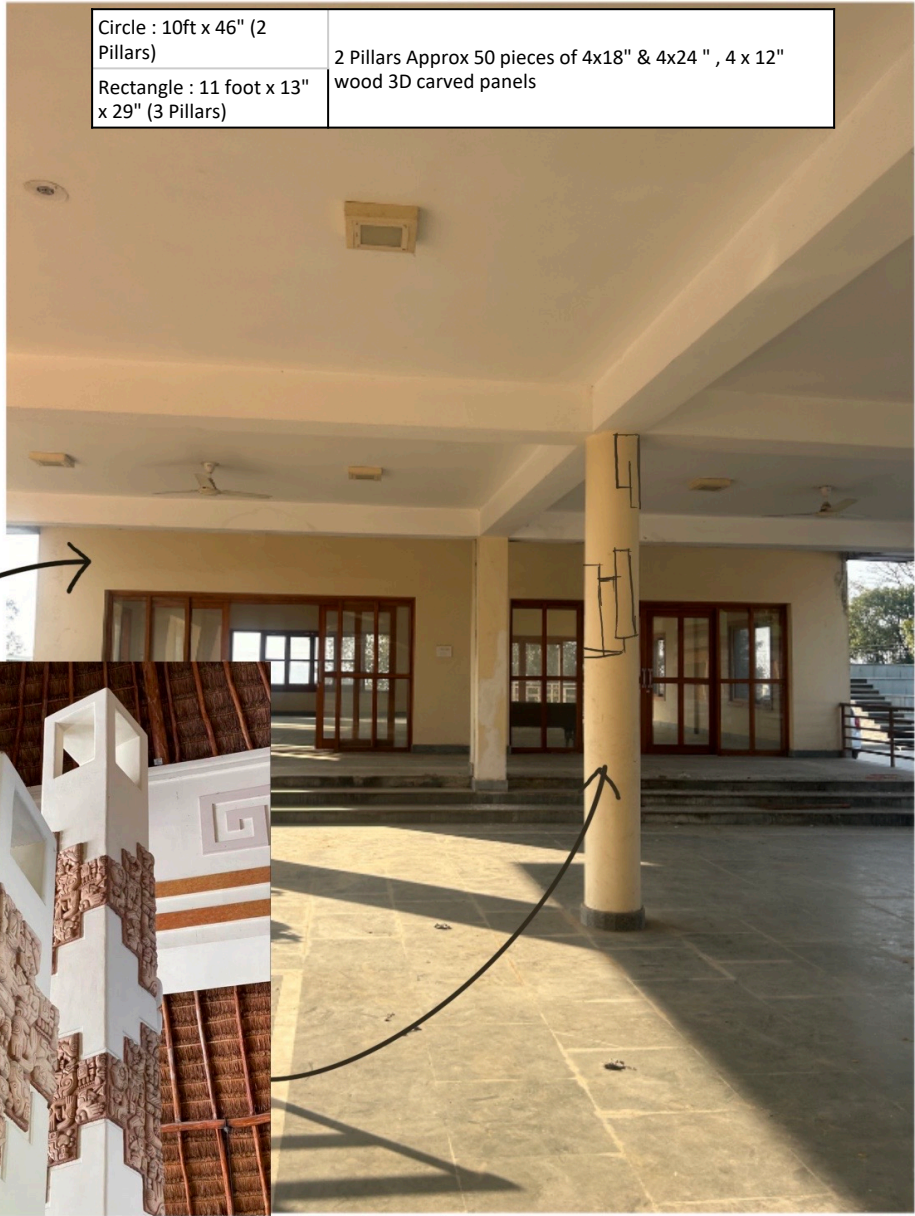
Woodwork Pillar Decor