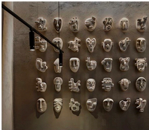
Statement wall with metal, slate , woodwork & pottery

117 x 173" 20 Slate pieces (Circular/Diamond) of 12 x 12 Inches ; 20 Pieces of 16 x16 Inch customised 15mm metal mohras in gold/silver & 7 Pieces of 24 x 24 inch customised 15mm metal mohras in gold/silver mounted on wall