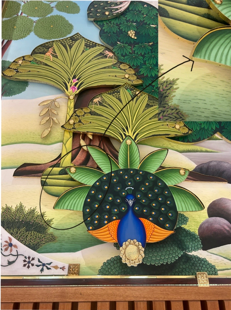
Mural 2 ( next to studio)

10mm PVC cut-outs with 1 inch stainless steel in gold borders/boundary around UV Print and acrylic finish. MAP Size : 48 x 53" ; Secondary elements in 3D fibre with approximate size of 2ft x 2ft. Number of secondary elements : 13. Additionally, 13 arrows in 3D ( 5MM Acrylic)